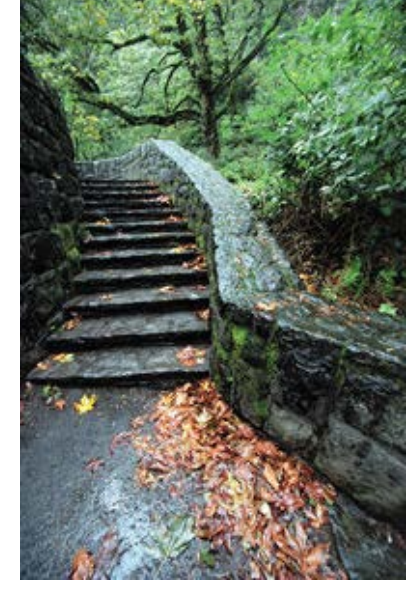
NPZ 800 really shows its stuff when both high film speed and great image quality are required. Pre-dawn light (top), deep shade (bottom) and natural-light macro in a greenhouse (middle) are just three examples of the kinds of things NPZ 800 handles very well. (Of course, it also handles its namesake—portraits—quite beautifully.)

photographers to work easily in a variety of lighting situations that can include low light, mixed light, and extreme lighting ratios. Photo opportunities involving tungsten, fluorescent, and window sunlight can now be exposed with a single exposure and only small adjustments in the final printing.