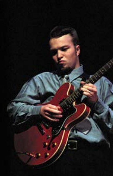
NPZ 800 permitted hand-held shooting (1/60 at f/5.6) in existing tungsten lighting.