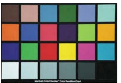
The standard Macbeth color chart, exposed at ISO 800, shows NPZ 800's excellent color and gray-scale reproduction.