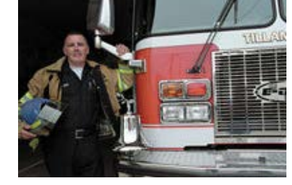
Colors are accurate in heavy overcast lighting.