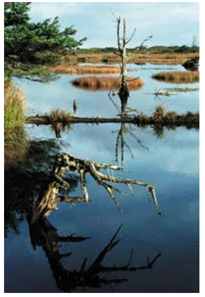
Despite its high speed, NPZ 800 is a good scenic film, allowing for lots of depth of field in early-morning light.

The next day we tried our luck at morning dew drops, flowers, and landscapes near our favorite beach on the Oregon Coast. In order to try the film for portraiture, we lined up a few willing candidates-Pat the local fireman, Kim the veterinary technician and AI the welder.